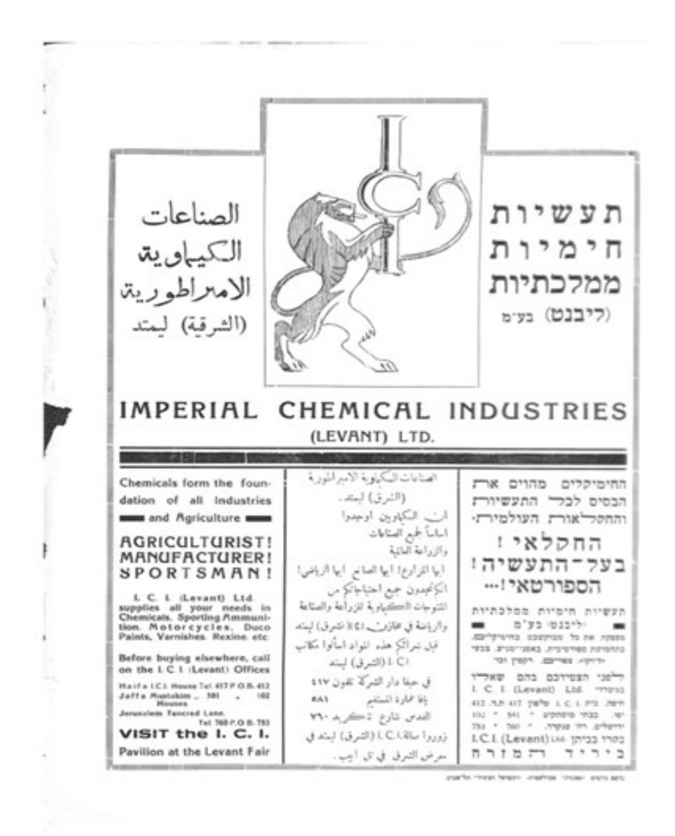
FIGURE 1: CI Levant's brochure at the Levant Fair (between 1932-36). "Levant Fair. Official Publications," V 3090/43, The National Library of Israel.