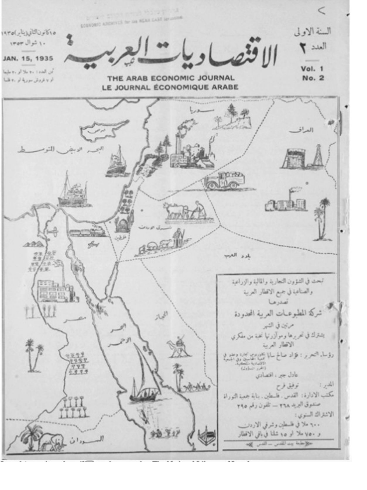
FIGURE 6: Cover page of Al-Iqtisadat al-'arabiyya I(2), 15 January 1935. Jrayed Collection: Arabic Newspapers of Ottoman and Mandatory Palestine, jrayed.nli.org.il, founded by the National Library of Israel.