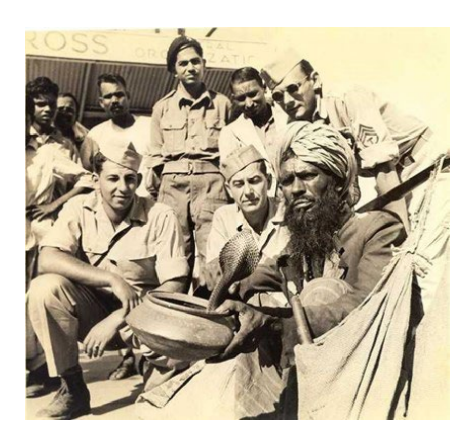
FIGURE 3: "A Group of GI's take a close look at the snake-wallah's hooded cobra. Both the snake and his master are good specimens. The fangs of course have been removed so the reptile can strike at will, scaring no one." Photograph and caption by Clyde Waddell. (Available in the public domain and free of known copyright restrictions: https://openn.library.upenn.edu/ Data/0002/html/mscoll802.html).

documented G.I. life in Calcutta better than the military photographer (and later Press Attaché to Lord Mountbatten) Clyde Waddell. Some of his photographs were elegant aerial shots of the city. Many featured the American soldiers manoeuvring their way through the streets. Most depicted scenes from regular Indian life with remarkable honesty and somewhat of an 'Orientalist' tinge—but more importantly, all were accompanied by his idiosyncratic annotations.<sup>45</sup> It is from Waddell that