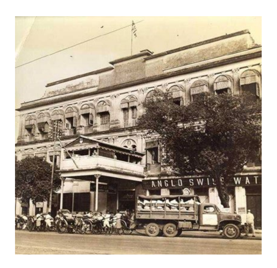
FIGURE 1: "The American Red Cross Burra Club, leave center for GI's and recreation spot for all enlisted men. The unpretentious façade belies an interior complete with dormitory, snack bar, restaurant, music room, games room, lounge, barber and tailor shops, wrapping service department, and post exchange." Photograph and caption by Clyde Waddell. (Available in the public domain and free of known copyright restrictions: https://openn.library.upenn.edu/Data/0002/html/mscoll802.html)

THUS SPOKE UNCLE SAM: PRESCRIPTIONS, PROSCRIPTIONS, AND TRANSGRESSIONS