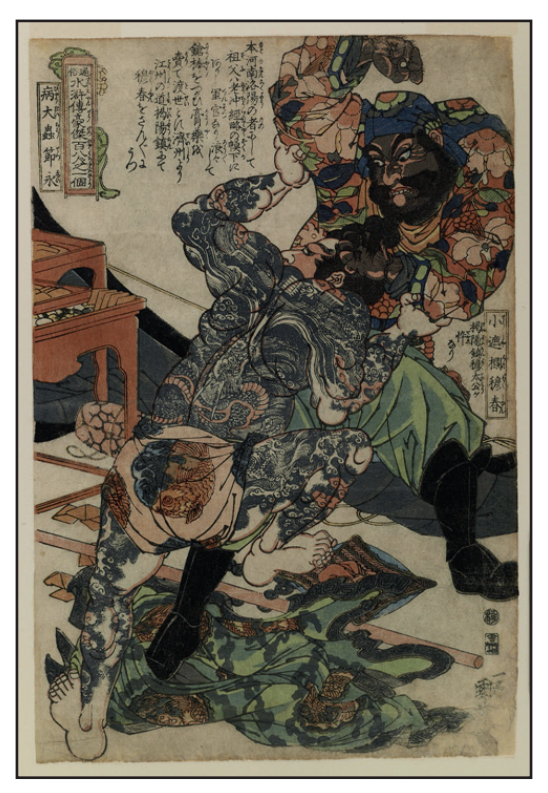
FIGURE 2. Utagawa Kuniyoshi: Tsuzoku Suikoden goketsu hyaku-hachi-nin no hitori . Pigments on mulberry paper, ca. 1827-30. Baltimore, Walters Art Museum.

The enlarged and elaborated depictions of tattoos on the exposed bodies became the most eye-catching site of these pictures. Since then, Kuniyoshi's prints were used as models for tattoos in Edo Japan. After World War II, when the ban on tattooing was repealed, the tradition of using ukiyo-e as tattooing designs has been revitalised, with the promotional appraisal of irezumi as the "living ukiyo-e".<sup>25</sup>