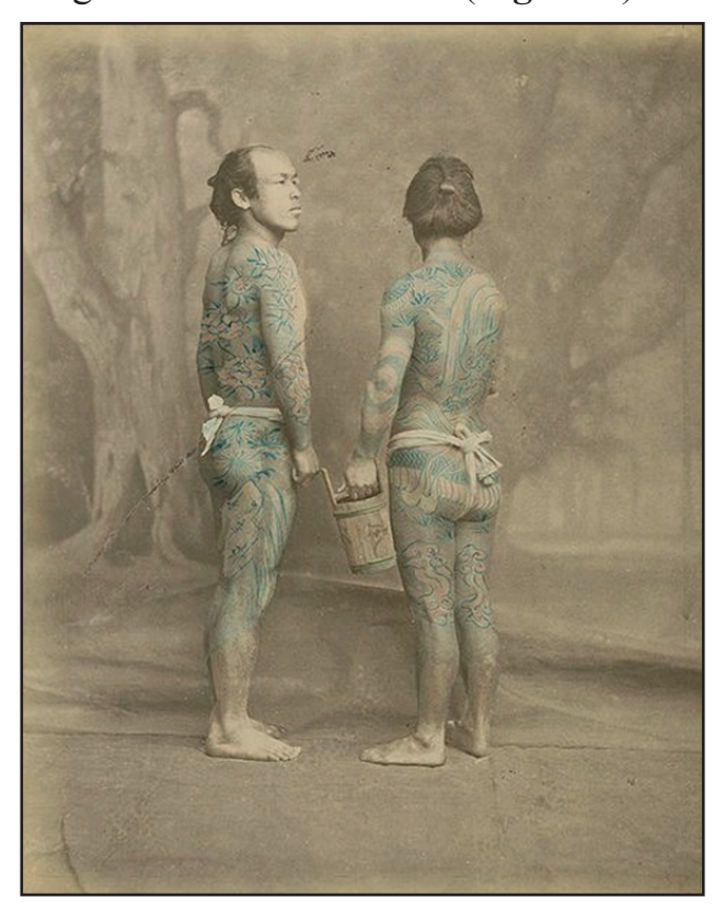
FIGURE 1. Felice Beato: Tattooed Japanese Firefighters. Hand-colored photograph, ca. 1870. Wikimedia Commons.

were similarly hand-painted to highlight the detailed lines and rich colours of the tattoos that covered large areas of their bodies ( Figure 1 ).