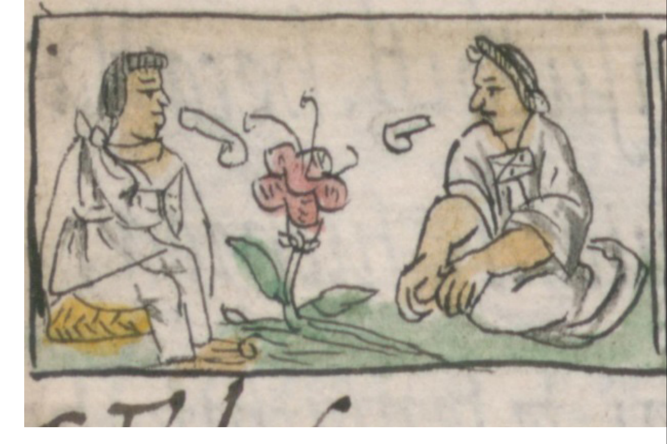
FIG. 2 Possible depiction of a xochihua (right), an Aztec social role possibly filled by masculinely sexed persons wearing femininely gender clothing.