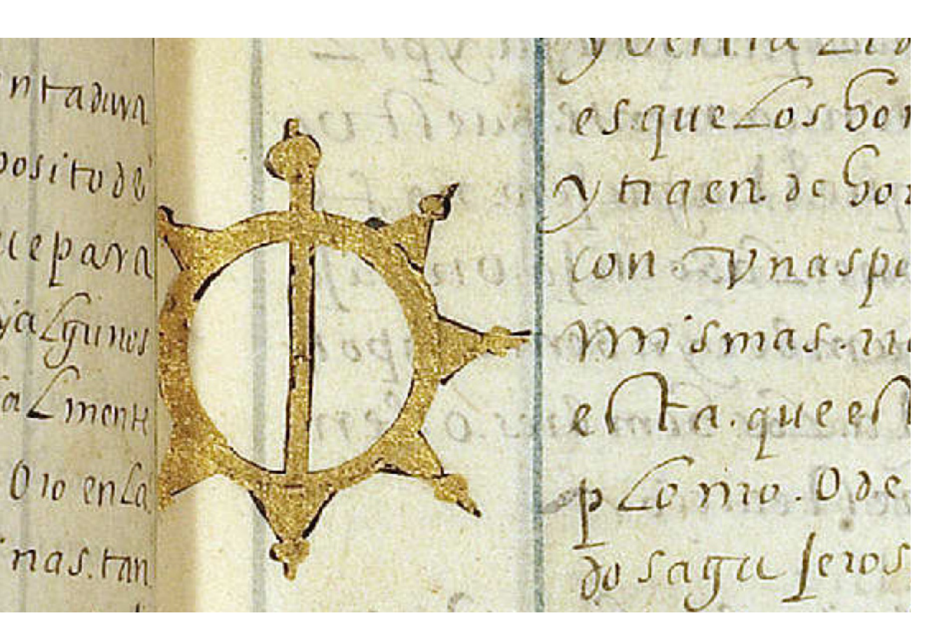
FIG. 3 Fragment of a drawing of a sacra.